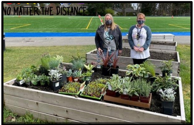
Somerset Sensory Garden: Plants with a variety of textures, scents, and colors were delivered to be planted for our students to experience and enjoy.